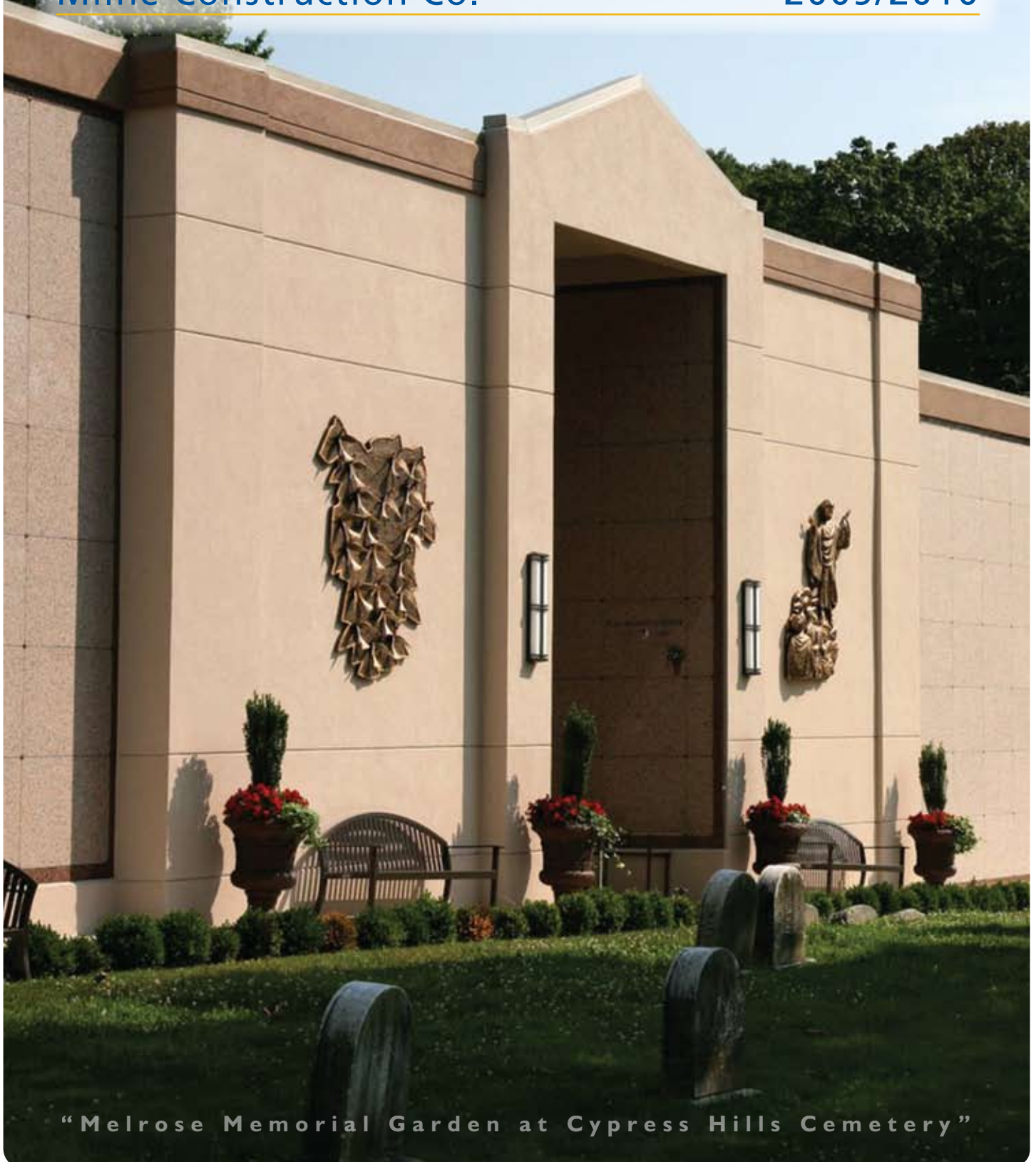
“Melrose Memorial Garden at Cypress Hills Cemetery”